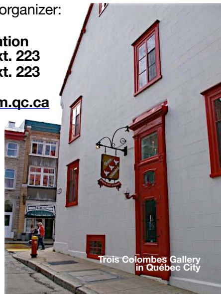
Trois Colombes Gallery in Québec City

The 10 th ICCP organizers reserve the right to decline/refuse any exhibitor.