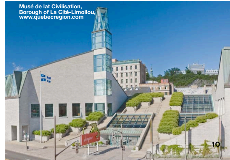
Musée de la Civilisation, Borough of La Cité-Limoilou, www.quebecregion.com