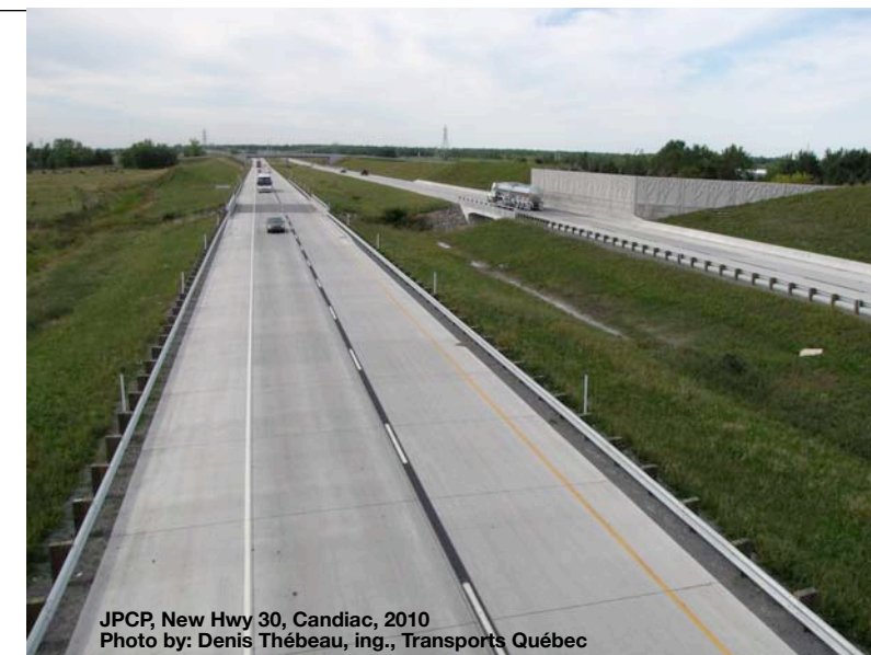
JPCP, New Hwy 30, Candiac, 2010

Leif Wathne , American Concrete Pavement Association (USA)