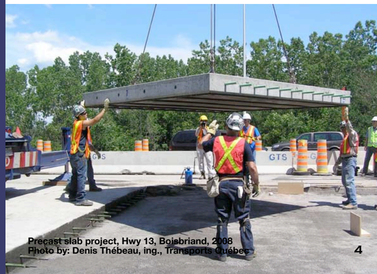
Precast slab project, Hwy 13, Boisbriand, 2008

Concrete pavement construction site visit Ciment Québec's cement plant visit Pont (bridge) Pierre-Laporte tour MTQ laboratory and survey equipment/University of Laval tours Québec City Airport runway site visit ASR sites visit