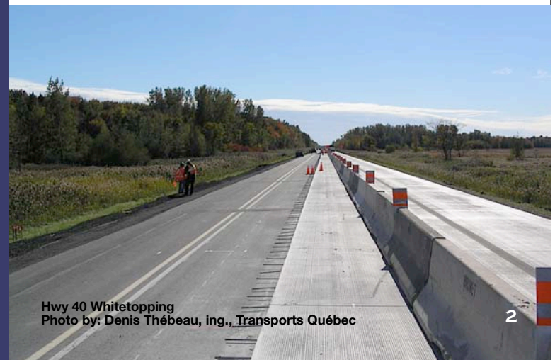
Hwy 40 Whitetopping

A strong exhibitor program is planned to showcase new products and services.