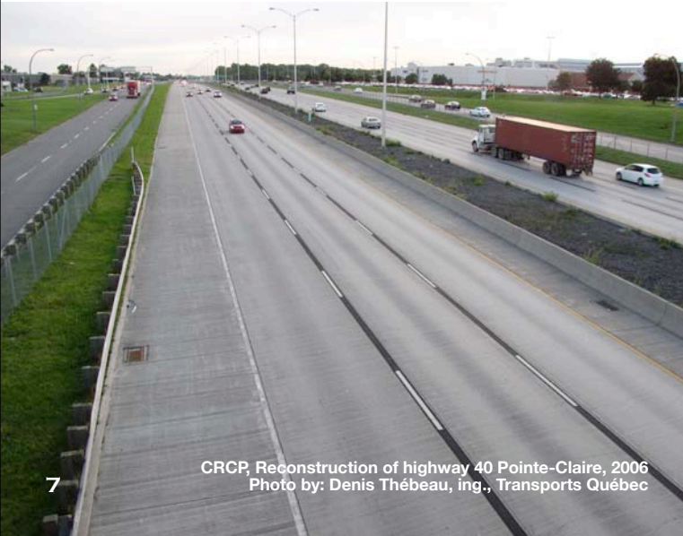
CRCP, Reconstruction of highway 40 Pointe-Claire, 2006

In the heart of historic Old Québec, Fairmont Le Château Frontenac has been a beacon of charm, warmth and hospitality for over 100 years. Recognized as one of the best resorts in North America by readers of Condé Nast Traveller, it continues to delight visitors with its 4-Diamond facilities.