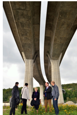
Technical Tour - Tunnel

For photos on the Symposium website, please go to: http://www.concreteroads2014.org/en/news .