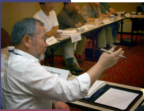
Education & Training