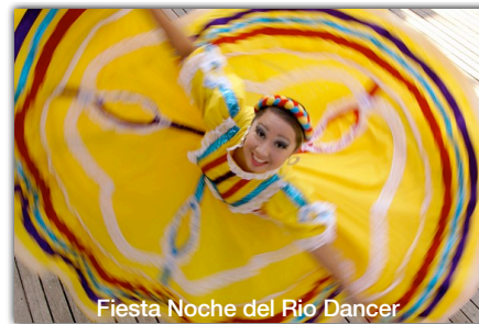
Fiesta Noche del Rio Dancer